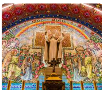
St Thérèse of Lisieux