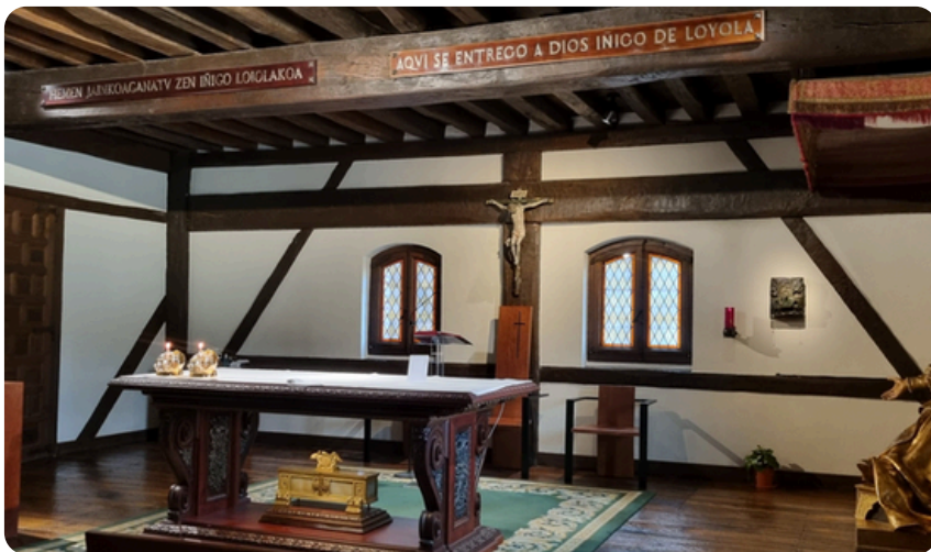
Here Inigo de Loyola surrendered himself to God