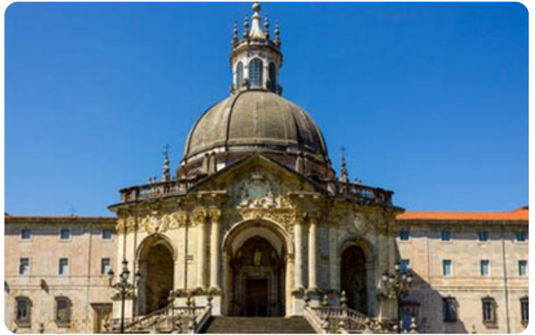
Basilica of Loyola, birthplace of St Ignatius