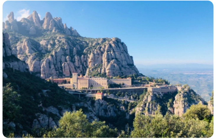
Benedictine Monastery of Montserrat above Barcelona