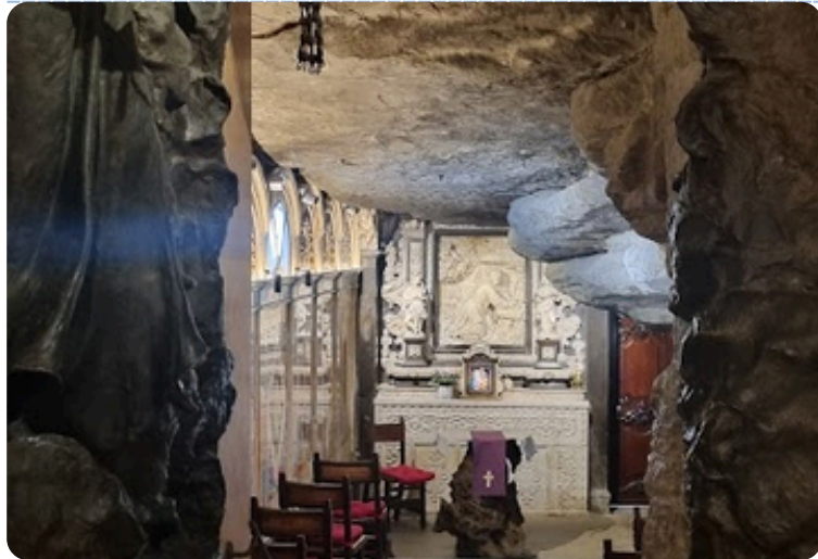
Cave of St Ignatius in Manresa where he lived in 1522