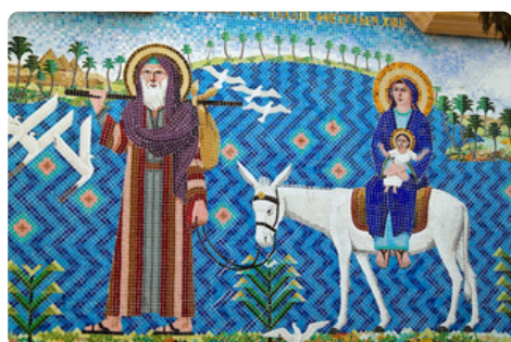
The Holy Family in Egypt