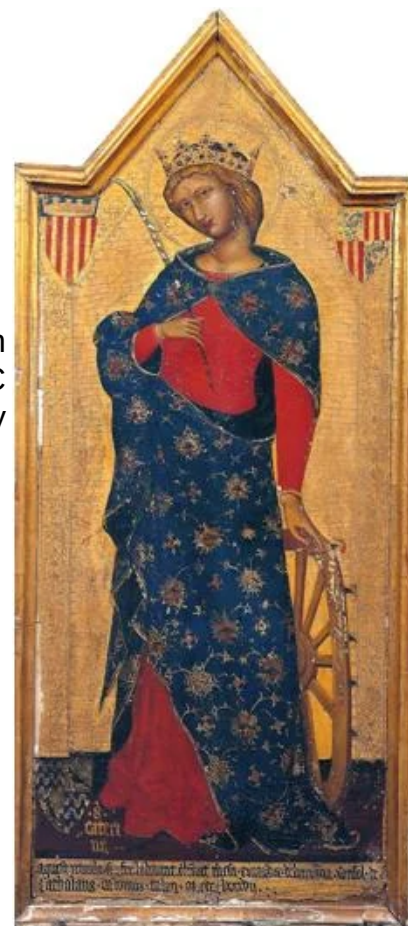
St Catherine of Alexandria