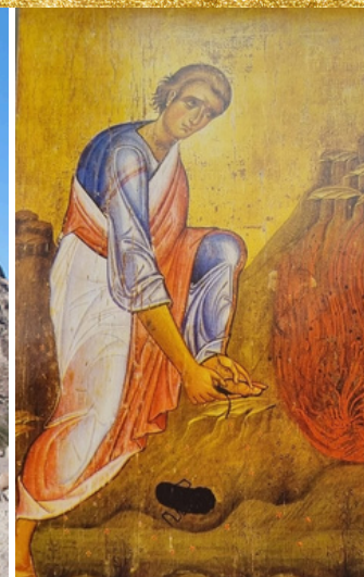
Moses and the Burning Bush