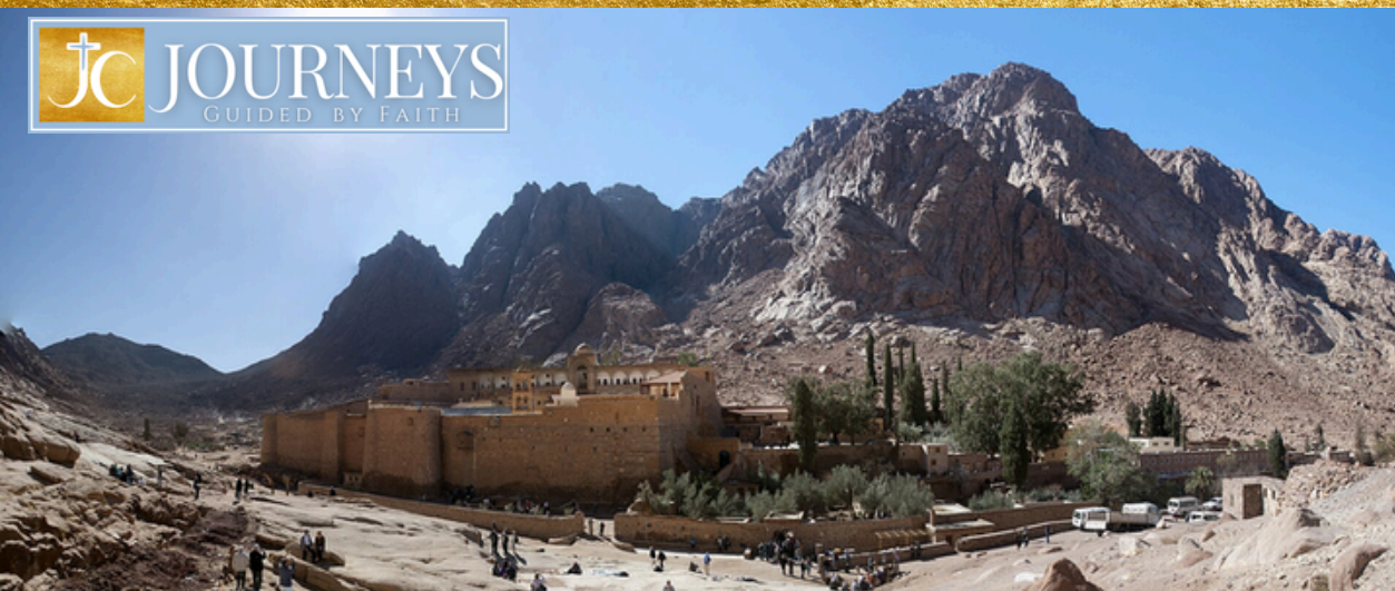
St Catherine's Monastery and Mount Sinai