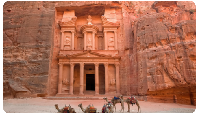
The Treasury, Petra