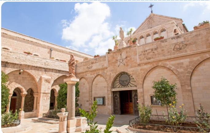
Church of the Nativity, Bethlehem