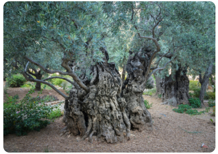
Olive tree in the Garden of Gethsemane