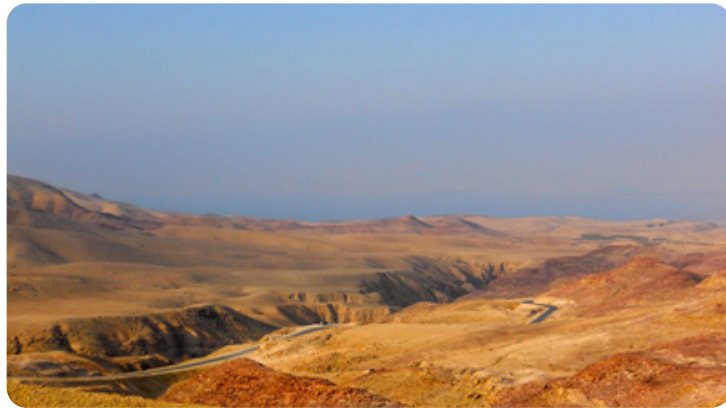
View from Mount Nebo