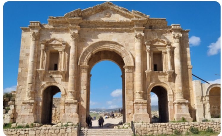
Hadrian's Arch, Jerash